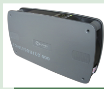
Battery Back Up