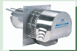
Powered Vent with WMO Safety