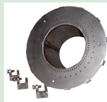
Wood Pellet Insert